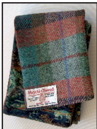
Rust and Jade