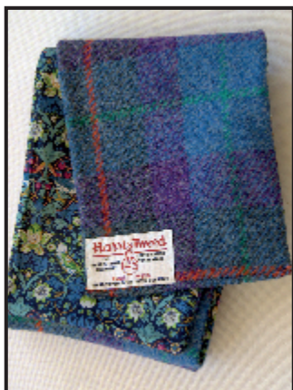
Blue and Purple

These very stylish scarves measure 150 x 14 cms and may be purchased singly or with a Ladycrow gift box