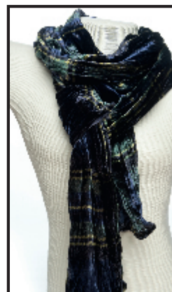
Blue and Green