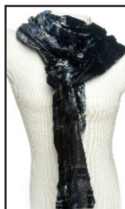
Black and Grey

TL Medium Velvet Scarf £21.75 TLB Gift boxed scarf £23.45 TLBB Gift boxed with Brooch or XL Celtic knot £28.25