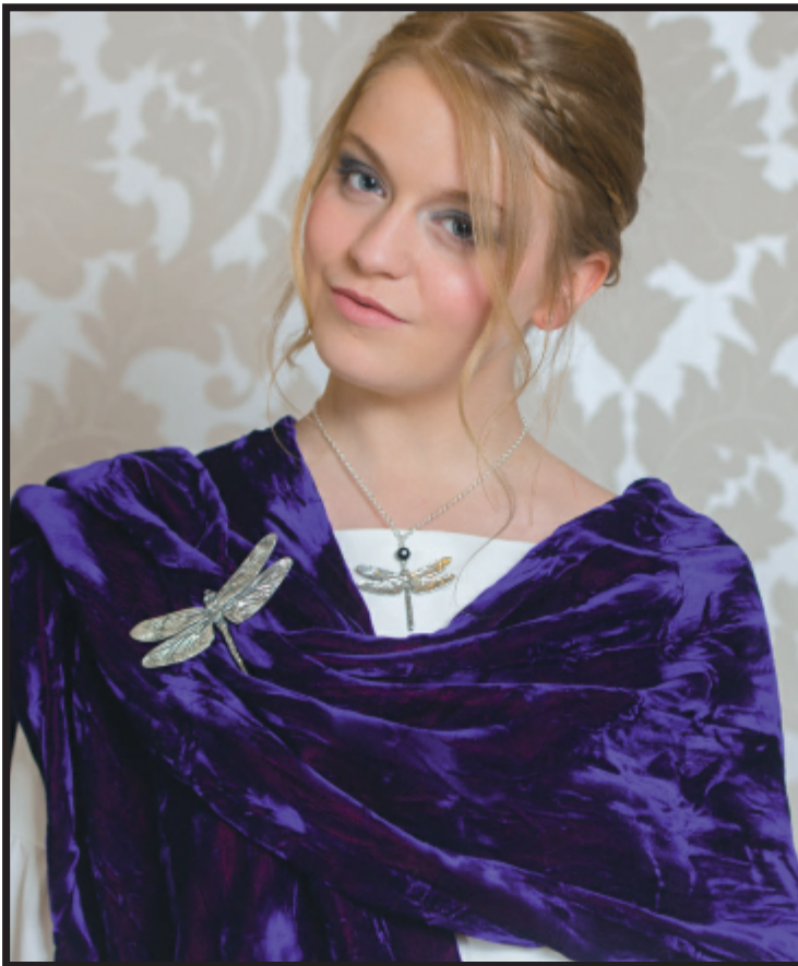
Amethyst with Dragonfly Brooch (PBBXL) and Dragonfly Necklace (PNS)

This two tone fabric reflects light and is both practical and beautiful to wear.