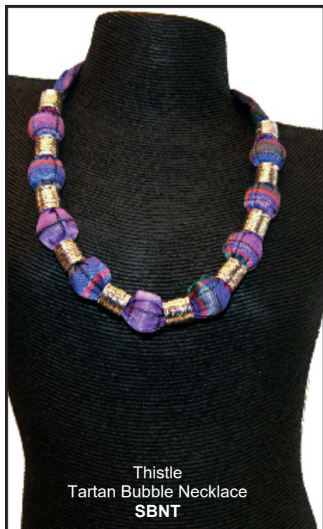
Thistle Tartan Bubble Necklace SBNT

TMB Tartan Magnetic Brooch £4.25 TPen Tartan Pendant £8.25