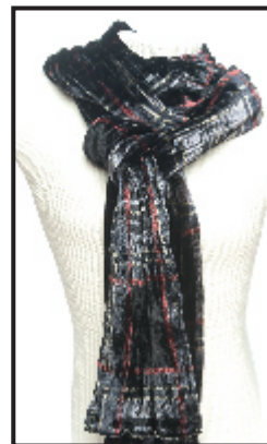
Black and Red

A very practical and smart accessory measuring 180 x 15 cms, choose from optional gift box or Pewter scarf ring set.