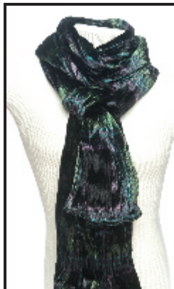
Black and Green