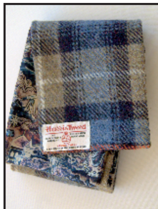
Fawn and Blue