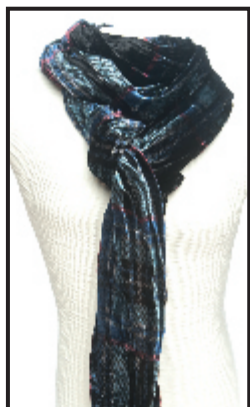
Black and Blue