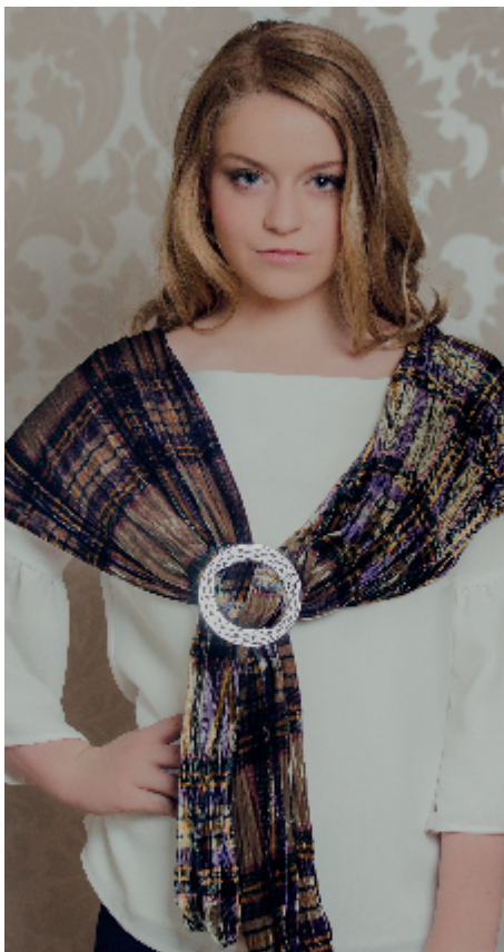
Extra large Celtic Knot scarf ring On large Twisted Tartan (TL)